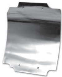
Stainless Steel Splash Guard