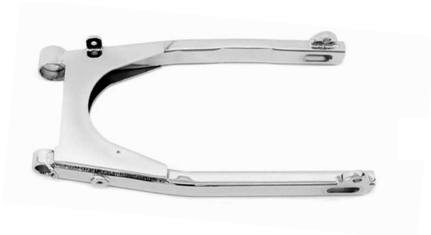
K20006 SWINGARM ASSEMBLY FOR EVOLUTION SPORTSTERS 1988-UP . . . CHROME