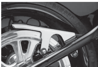
Raw or Chrome Shorty Rear Belt Guard