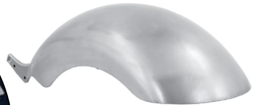
13-1/2" Strutless Round Top Fender