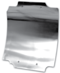
Stainless Steel Splash Guard