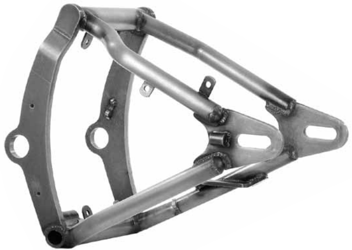
K20009 REPLACEMENT SWINGARM ASSEMBLY FOR SOFTAILS 1987-1999 . . . REPLACES OEM 47537-89A