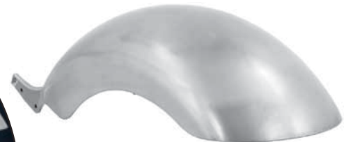
13-1/2" Strutless Round Top Fender