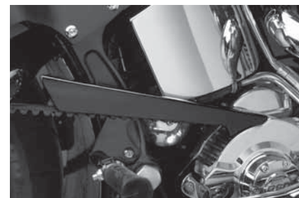
Raw or Chrome Front Belt Guard