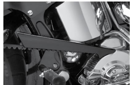
Raw or Chrome Front Belt Guard