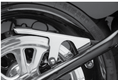
Raw or Chrome Shorty Rear Belt Guard