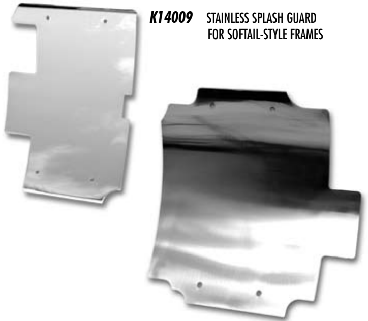
K14009 STAINLESS SPLASH GUARD FOR SOFTAIL-STYLE FRAMES

Looking for an inner debris deflector that fits well, looks great and gets the job done . . . this is the one. Crafted from quality stainless steel, then polished, this splash guard mounts to Softail models 1986-1999 and fits our Softail-style frames too.