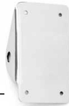
Right or Left Side Mounting