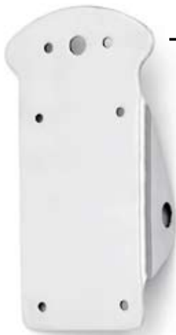
Right or Left Side Mounting

Here's a fine selection of simple, yet sturdy, axle-mount taillight and license plate brackets. Designed for either left side or right side mounting, these durable stainless creations are offered as a complete assembly for both license plate & taillight or license plate only. They're made for Softtail-style or Rigid frames when running wheels with 3/4" rear axles.