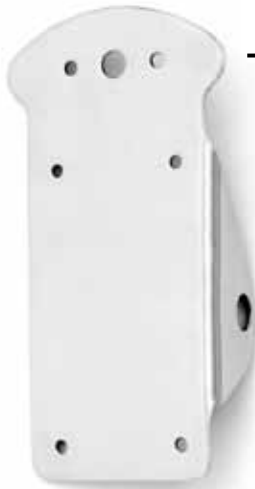
Right or Left Side Mounting

Here's a fine selection of simple, yet sturdy, axle-mount taillight and license plate brackets. Designed for either left side or right side mounting, these durable stainless creations are offered as a complete assembly for both license plate & taillight or license plate only. They're made for Softail-style or Rigid frames when running wheels with 3/4" rear axles.