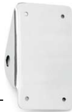
Right or Left Side Mounting